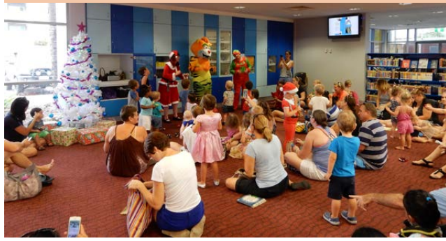
Storytime at City of Palmerston Library

Storytime provides a positive and safe environment for children to appreciate reading and literacy through storytelling, singing and dancing.