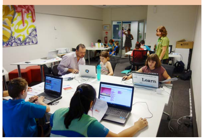
Code Club at City of Darwin Libraries

City of Darwin Libraries offer is Code Club as part of a network of free, volunteer-led, after school coding clubs for children aged 9-12 years. Code Club helps strengthen problem solving and logical thinking and supports key academic subjects such as maths, science and technology.