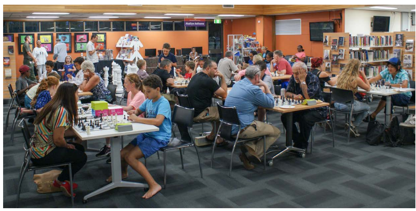
Chess Club at Alice Springs Public Library