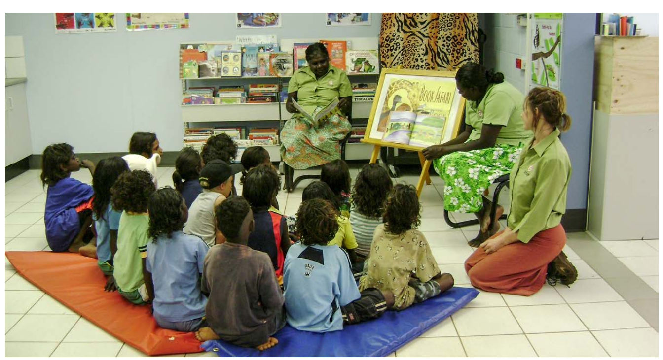
Storytime at Wadeye Library