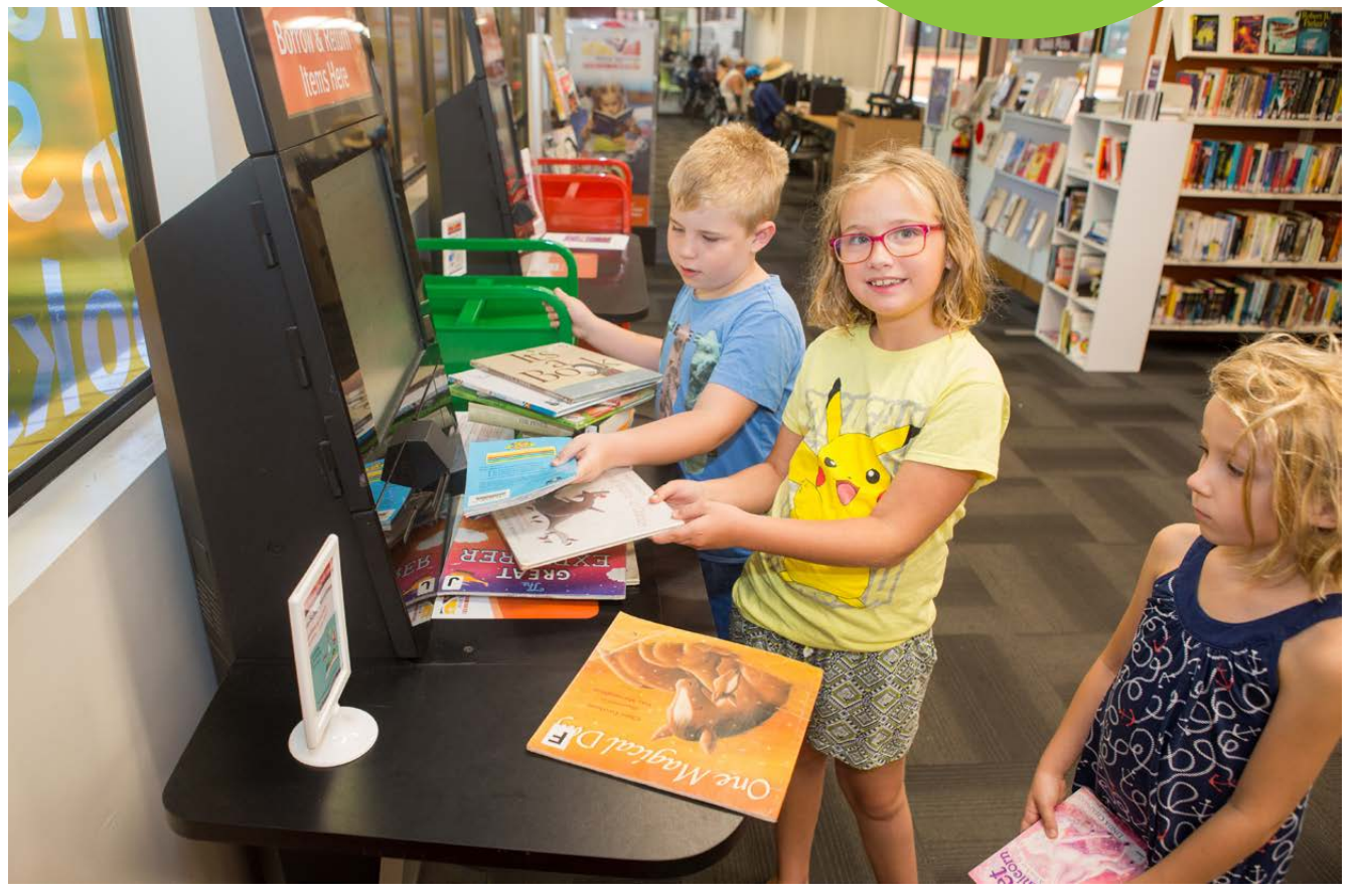
Alice Springs Library

People are increasingly turning to libraries for support in navigating e-government services