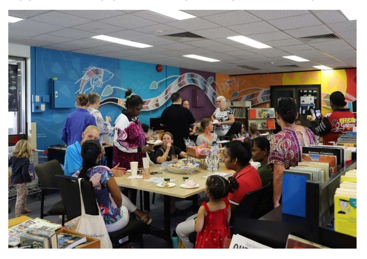
Jabiru Public Library – International Women's Day event

To enhance digital literacy, the Katherine Public Library collaborated with NBN and COTA to host a seminar covering essential topics like media literacy, scam awareness, and technology usage. Additionally, three BorrowBox support sessions were held for seniors, offering personalized guidance on navigating the platform and discovering new stories efficiently. For younger patrons, Red Dirt Robotics delivered a workshop introducing kids to robotics and programming. Known for hands-on teaching, Red Dirt Robotics engaged children through games and challenges, blending play with technology education.