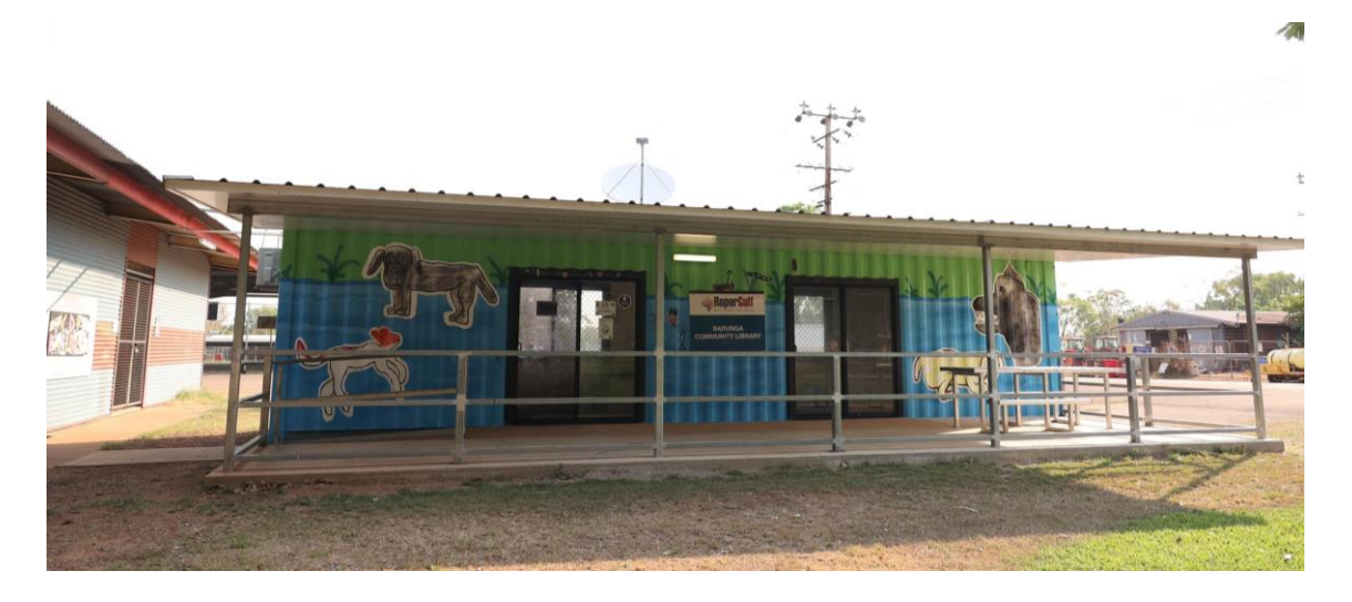
Barunga Community Library

In an exciting collaboration, the Barunga Library has become part of a community project to transform its exterior with a vibrant mural. Working with the children from Barunga and Manyallaluk communities, the mural's design draws inspiration from two beloved local books, Our Barunga Dogs and Shordy Creek . With guidance from a local Territory artist, the children helped conceptualise and paint the mural, bringing stories from their community to life on the library walls. This creative project enhanced the physical space and deepened the connection between the library and the local community. The children's involvement in the mural has helped solidify the Barunga Library as a vital hub for learning, creativity, and cultural expression. By reflecting the community's stories and talents, the library continues to demonstrate its positive role in community life—fostering literacy, artistic expression, and a sense of pride in local culture.