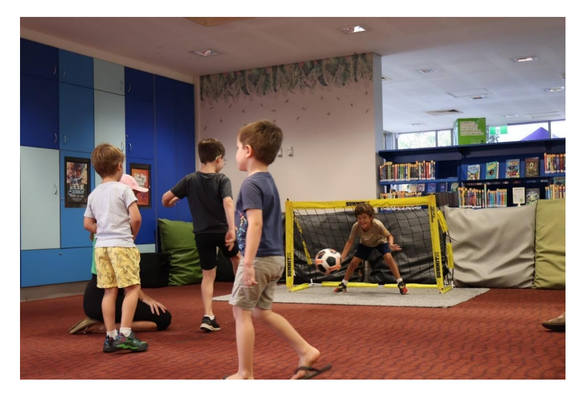
City of Palmerston Library - School Holiday Program

The Strategic Vision outlines the six national outcome reporting areas as well as six strategic goals for the NT public library sector with several guiding principles that align with the ALIA Guidelines, Standards and Outcome Measures for Australian Public Libraries 2021. Collectively these outcomes, goals and principles inform the provision of public library services in the Northern Territory to meet the purpose of creating contemporary library services that foster literacy and learning and build stronger communities through empowerment, accessibility, and inclusion for all.