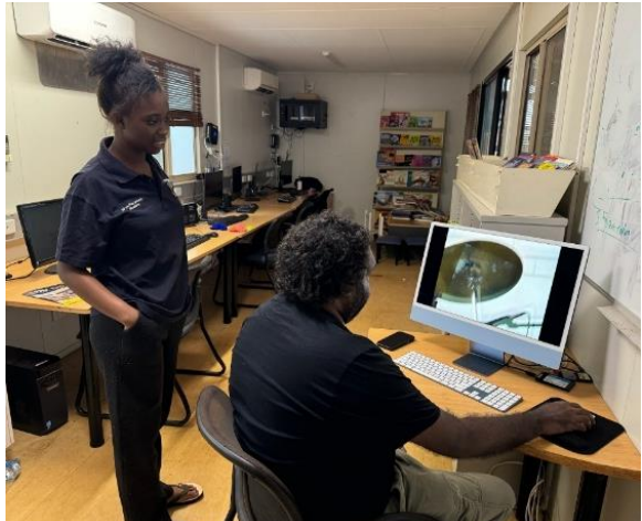
Mataranka Library/Never Never Museum