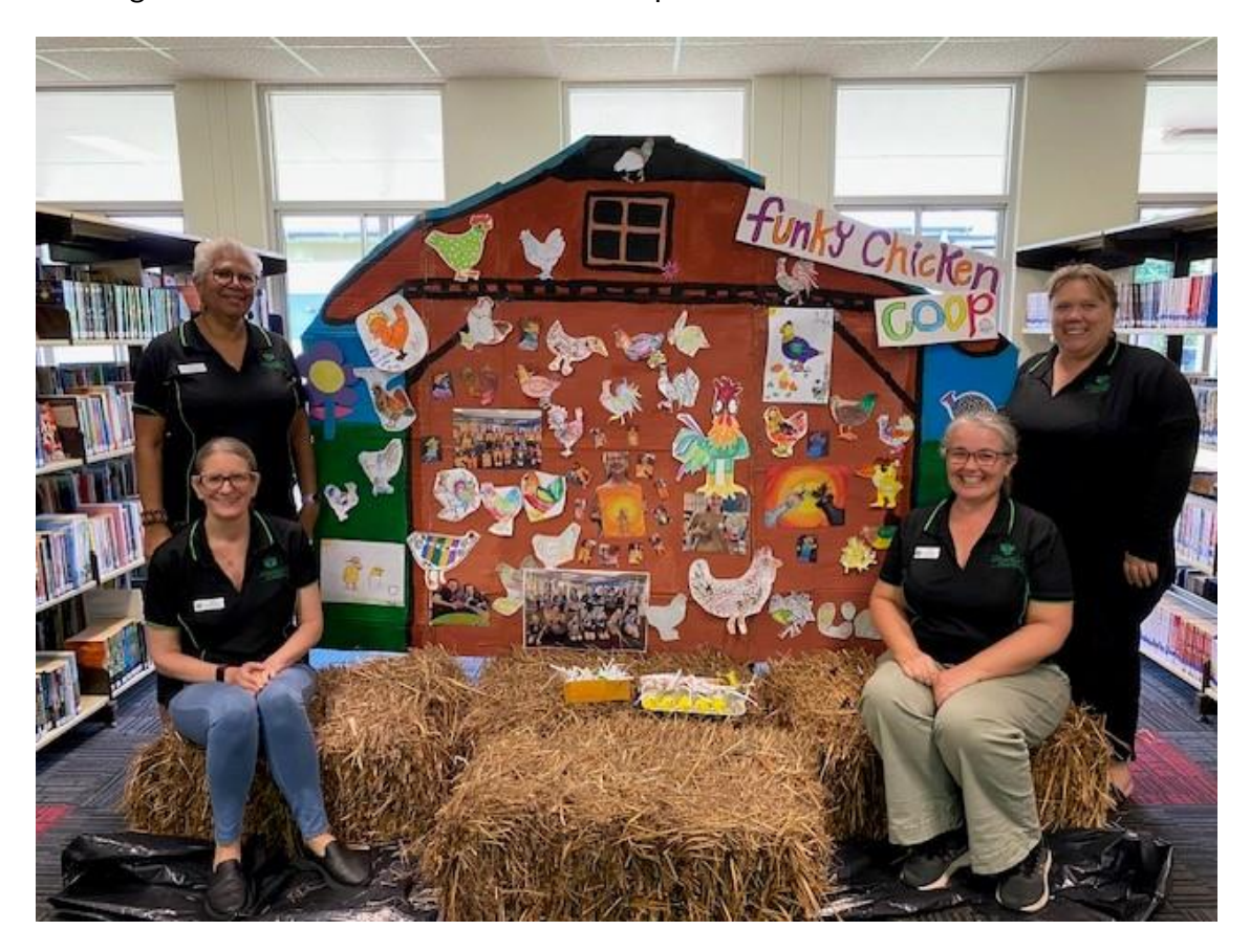
Taminmin Community Library - Funky Chicken Coop

Taminmin Community Library runs a number of programs to enhance personal development and wellbeing. Passive programming supports this outcome through flexible "Anytime Activities" during school holiday periods. The initiative enables families to attend and engage in library activities at a time that suits them. The initiative has increased library visitation and program participation through crafts and community collaborative projects. The popular Bookmark Competition demonstrated an innovative way to incorporate Anytime Activities whilst increasing community ownership of the library and promoting the Funky Chicken Reading Club. Two winners had their artwork printed as new TCL free Bookmarks.