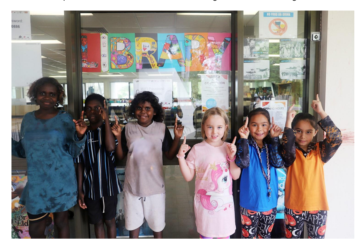
Jabiru Public Library - West Arnhem Regional Council

The Northern Territory Public Library Sector consists of thirty-one libraries. Thirty are provided at physical locations; one is digital and delivered across thirteen remote communities in the MacDonnell Region. In addition, forty-eight Community Internet Sites across the Northern Territory provide free internet access to remote First Nations communities. This report presents the achievements of Northern Territory Public Libraries during the 2023/2024 financial year and outlines how those achievements contribute to the successful implementation of the Libraries Connecting Communities Strategic Vision 2023-2028.