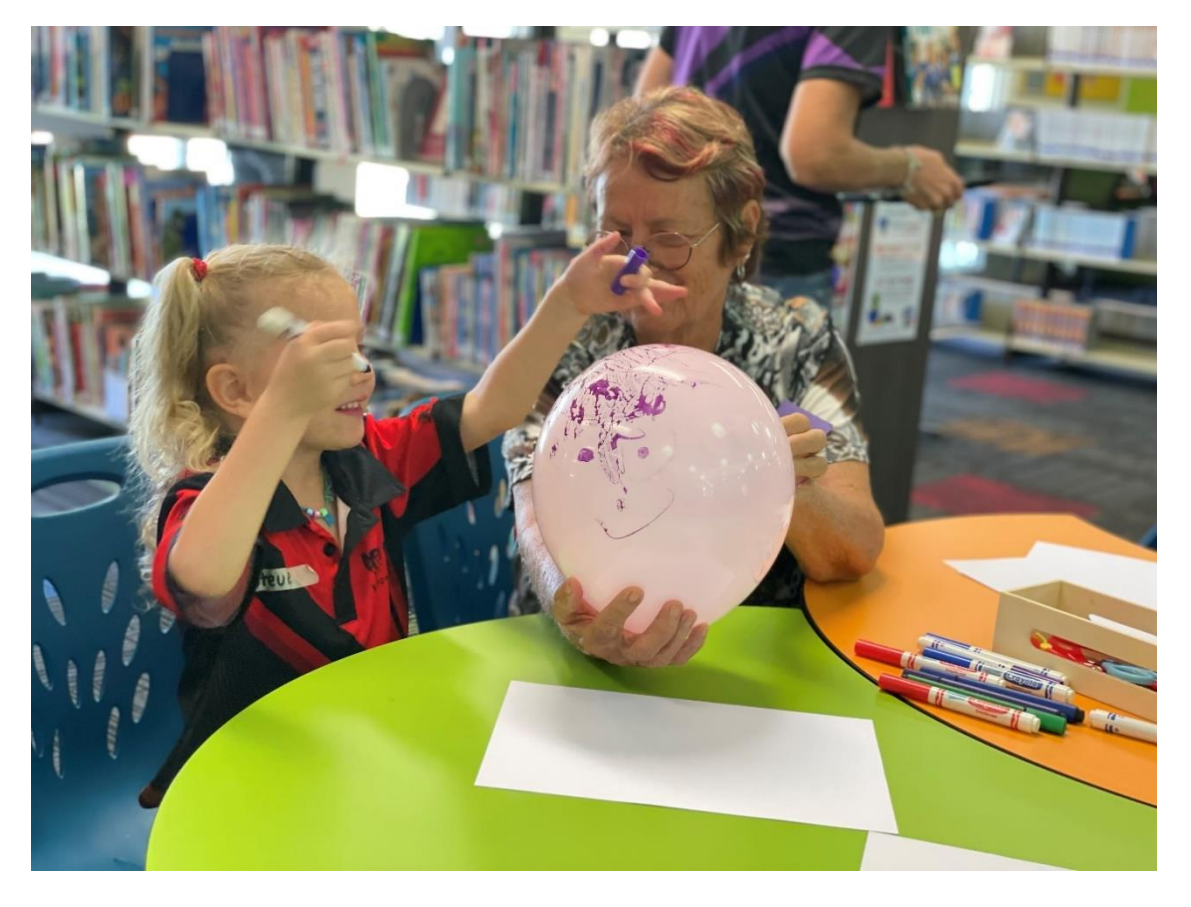
Taminmin Community Library - Little Buddies and Big Buddies Program

The monthly Student vs. Seniors intergenerational program, in partnership with Taminmin College, continues to be well-attended through FY2023-24. The program connects the older rural generation and youth, addresses ageism bias, and finds common ground through shared topics and activities. Taminmin Community Library is also seen as the place in the rural area for sharing local information, new programs or events, and general community notices. Staff also provide ad-hoc advice and assistance to community members to access online government services.