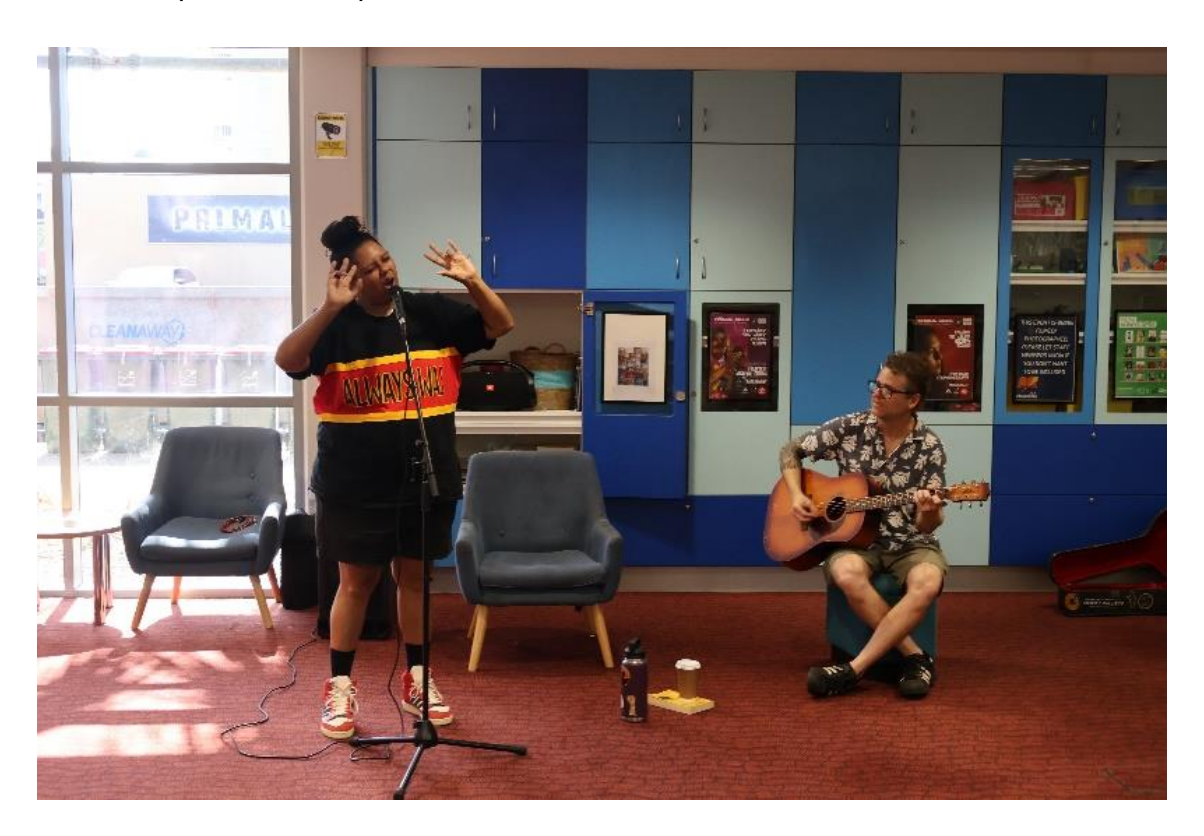
City of Palmerston Library - NAIDOC Week event

The PAW Media organisation donated a computer to the Lajamanu Library and install videos and movies in Walpiri which is a great partnership beneficial to the school and the community at large. A plan is in development to expand the partnership to incorporate further engagement and training on digital designs and media productions by the PAW technicians.