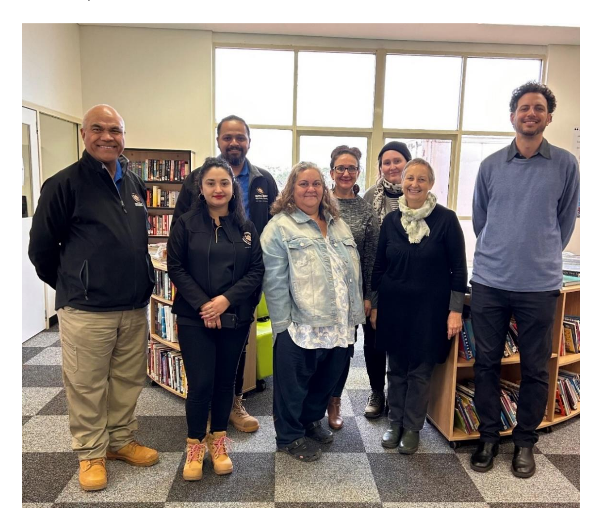
Sectoral visit to Ti-Tree Library - Central Desert Regional Council

Representation of the Northern Territory Library sector is a key role of Library & Archives NT. Through its partnerships with the Australian Public Libraries Alliance (APLA), Australian Library & Information Association (ALIA) and National & State Libraries Australasia (NSLA), Library & Archives NT has worked on several key committees for the benefit of NT Public Libraries.