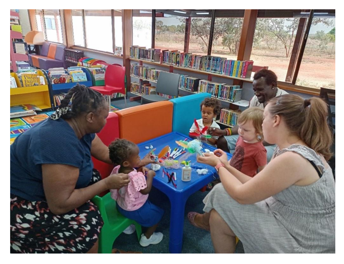
Tennant Creek Public Library - Craft Critter Program

Public libraries, through their resources, programs, and spaces, provide numerous opportunities for everyone in the community to develop their reading and literacy skills, encouraging and enabling people to pursue formal and informal lifelong learning. Public libraries have a positive effect on individuals and their communities by enabling people to become lifelong learners. This is integral to developing people's knowledge and skills in order to support their ability to make informed choices for employment, health and well-being.