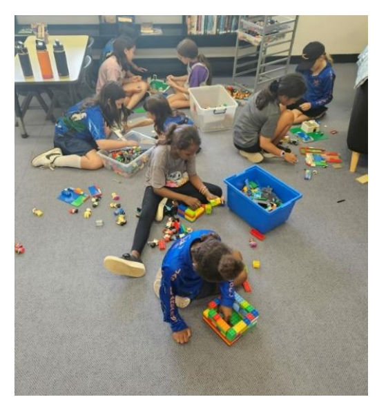
Jabiru Public Library - STARS program playtime