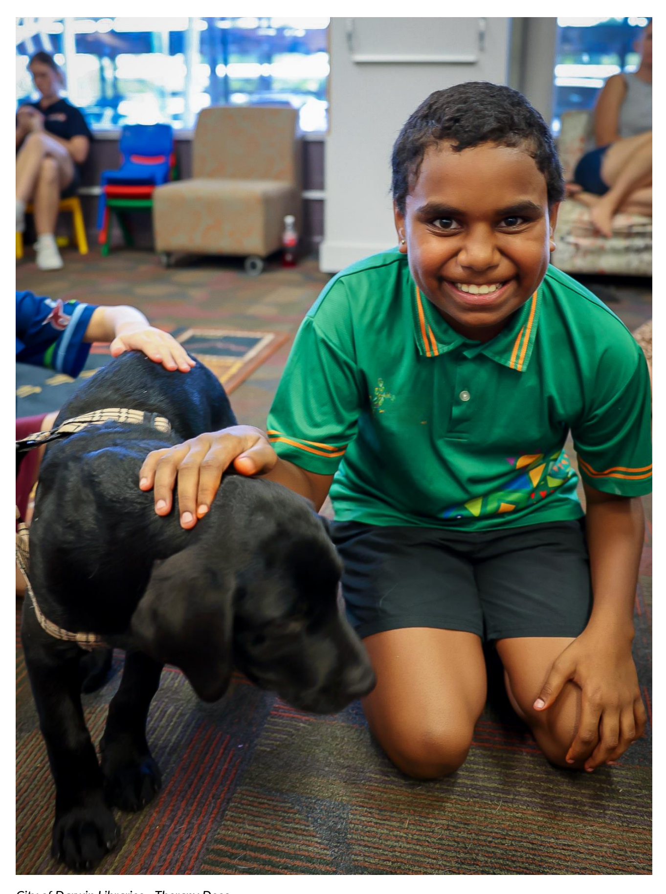
City of Darwin Libraries - Therapy Dogs Front cover image: Ramingining Library – East Arnhem Regional Council