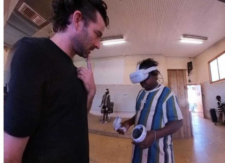
Participants, MacConnect program