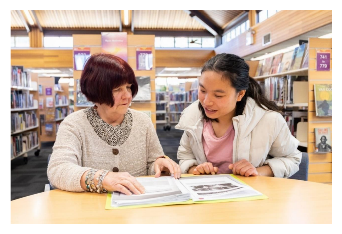
Alice Springs Public Library - Read Write Chat Program

The Read Write Chat program at Alice Springs Library empowers migrants and refugees by enhancing their English literacy and equipping them with essential life skills. The program provides one-on-one language tutoring, pairing each participant with a volunteer, determined by individual needs. With thirteen volunteers and twenty-five participants, the program goes beyond traditional literacy services to address practical challenges newcomers face daily. Most of the participants are non-native English speakers and receive tailored support to improve their language skills and navigate essential services such as healthcare, government paperwork, and driving license requirements. For instance, volunteers help participants fill out forms, prepare for theoretical driving tests, and practice job applications and interviews. Volunteers come from diverse backgrounds, including retired educators and professionals, ensuring a wealth of knowledge and experience. We match volunteers and participants, considering cultural and religious factors to create a comfortable and supportive learning environment. The program contributes immensely to helping mutual understanding and cultural exchange, leading to long-lasting connections between participants and volunteers.